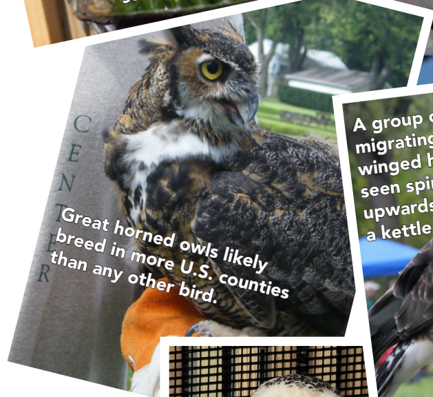
Great horned owls likely breed in more U.S. counties than any other bird.