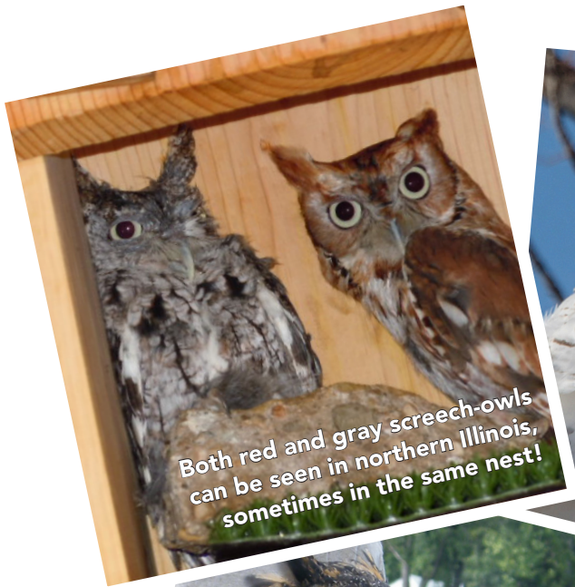
Both red and gray screech-owls can be seen in northern Illinois, sometimes in the same nest!