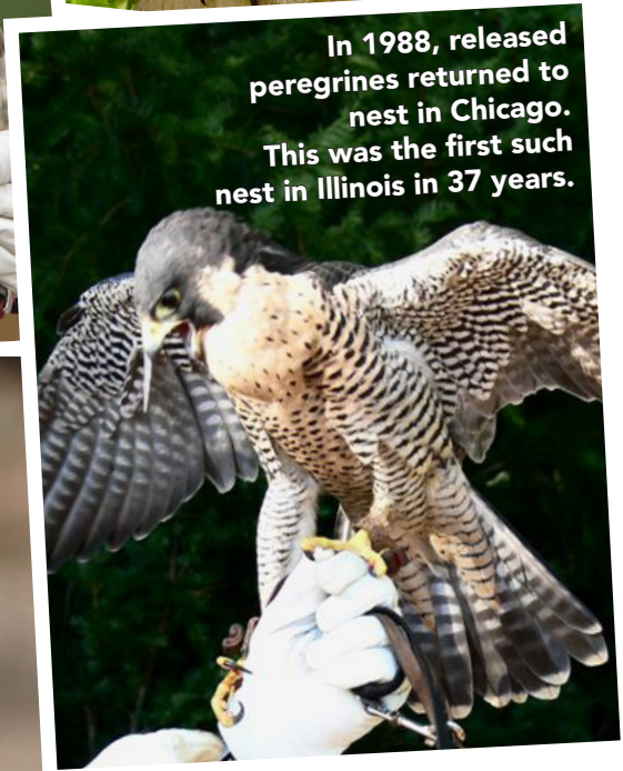
In 1988, released peregrines returned to nest in Chicago. This was the first such nest in Illinois in 37 years.