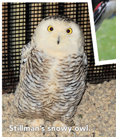
Stillman's snowy owl.