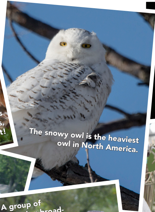
The snowy owl is the heaviest owl in North America.