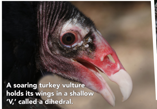
A soaring turkey vulture holds its wings in a shallow 'V,' called a dihedral.