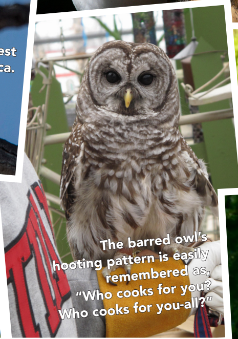
The barred owl's hooting pattern is easily remembered as, "Who cooks for you? Who cooks for you-all?"