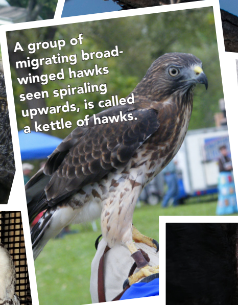
A group of migrating broad-winged hawks seen spiraling upwards, is called a kettle of hawks.