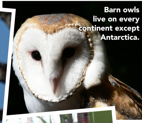
Barn owls live on every continent except Antarctica.