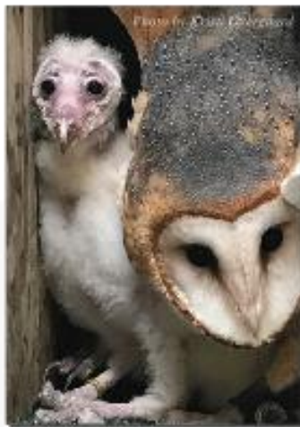
One of the owlets with the female on July 7. As some might say, the owlet has a face that only a mother could love!