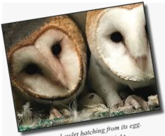
Second owlet hatching from its egg. The male is on the right.