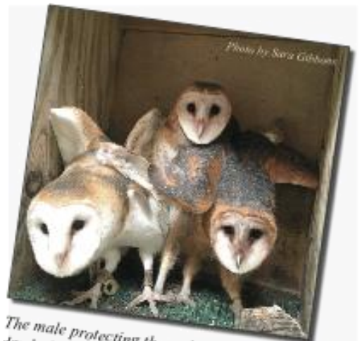
The male protecting the owlets on Aug. 3, the day before they were transferred to the World Bird Sanctuary near St. Louis. There they will contribute to the Sanctuary's barn owl release project in eastern Missouri.