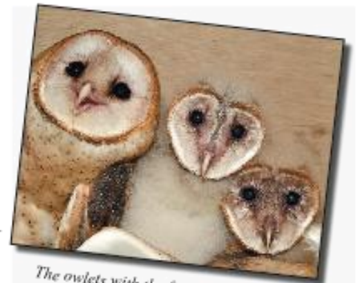
The owlets with the female on July 22, roughly five weeks old.